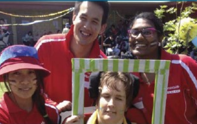
Teams of Woodside employees work together to assist the community.