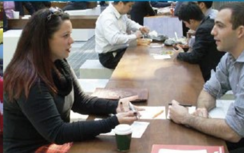
Woodside skills-based volunteers offer their professional skills to provide targeted assistance that will build capacity within not-for-profit organisations.